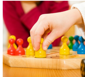
Bring your best game skills to City Hall!

The first game night is proposed for February if COVID-19 guidelines will allow. Tentative time is from 6:30-8:30PM. The City will provide some games such as dominoes, cards, scrabble, and Pictionary to name a few.